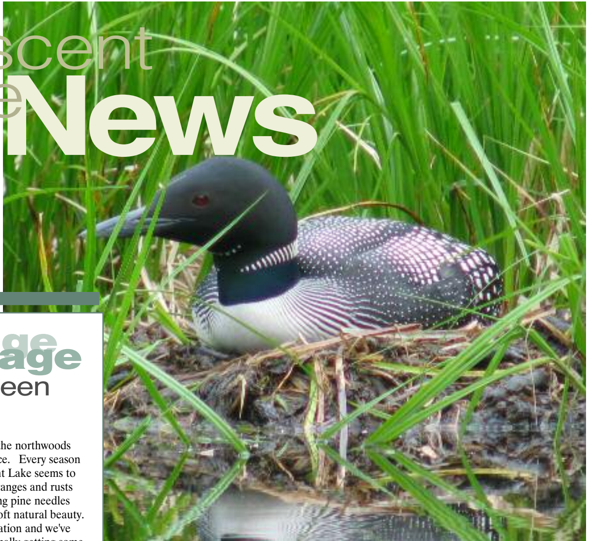
One of our beautiful loons on Crescent Lake.