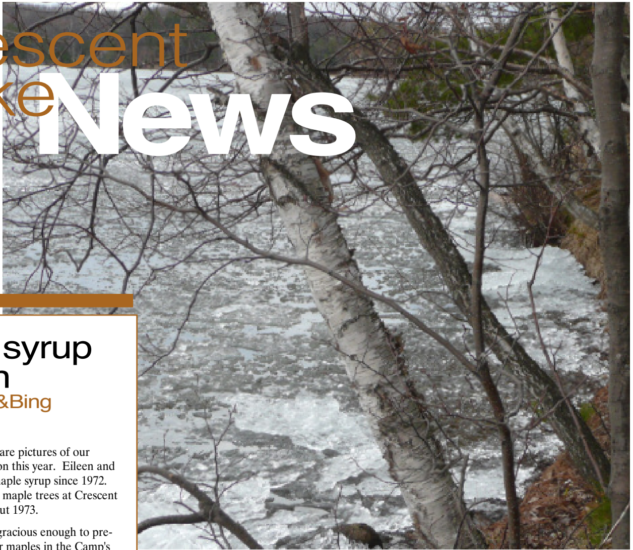
Ice finally breaking up on Crescent Lake, April 26, 2008.