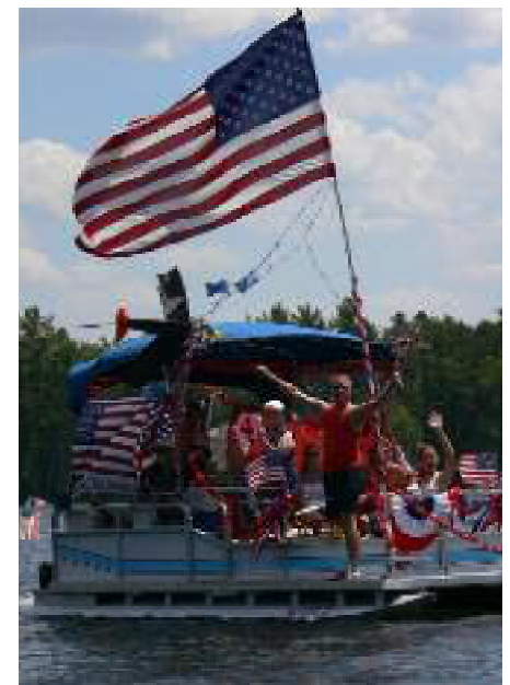
Only a few of the creative entries from last year's Boat Parade