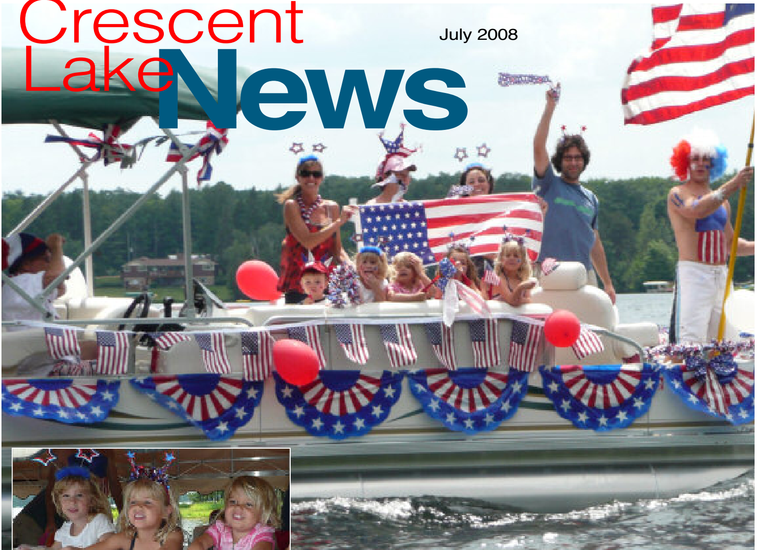
Crescent Lake Boat Parade.