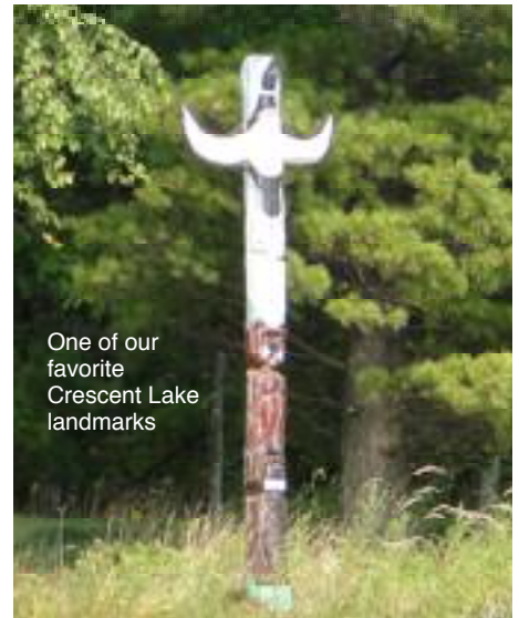
One of our favorite Crescent Lake landmarks

Call 282-6565 for reservations or tee times