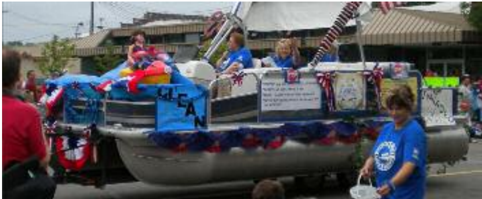
Rhinelanders Parade Float; thank you Lake Julia, Squash Lake, Crescent Lake volunteers