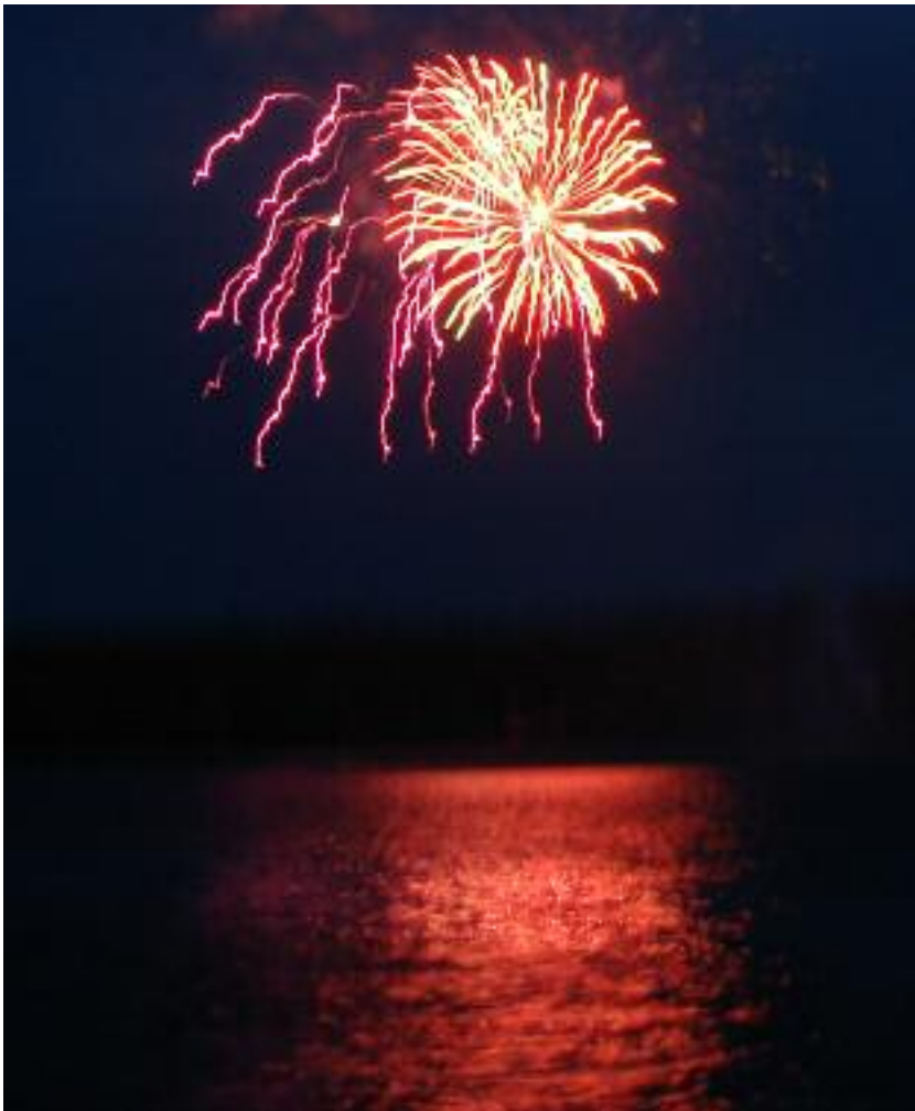
Beautiful fireworks; reflection courtesy Crescent Lake