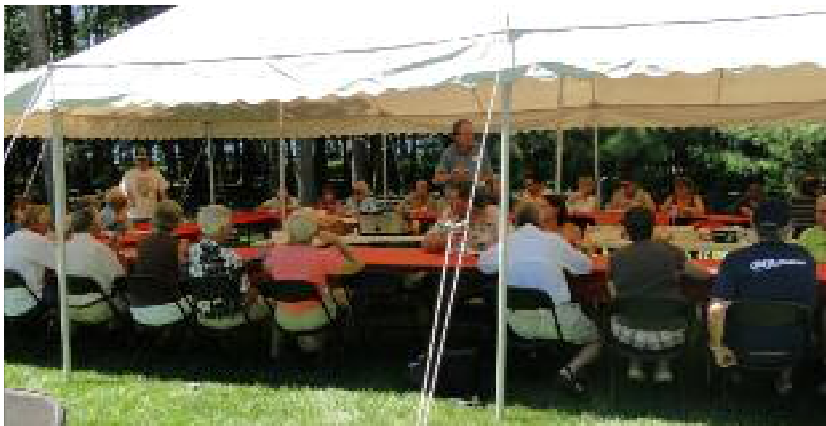
Crescent Lake Association Annual Meeting on July 17; GREAT FOOD & COMPANY